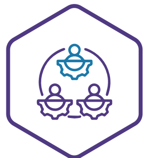
Job placement Assistance